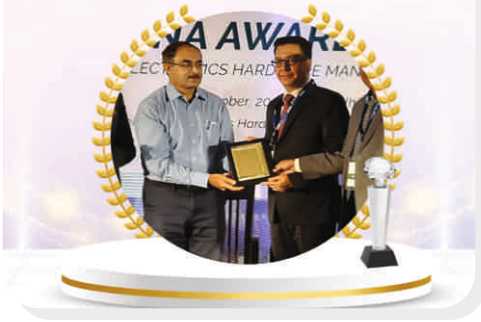
ELCINA-EFY Certificate of Merit for Outstanding Achievement in "Exports" Year 2020-21