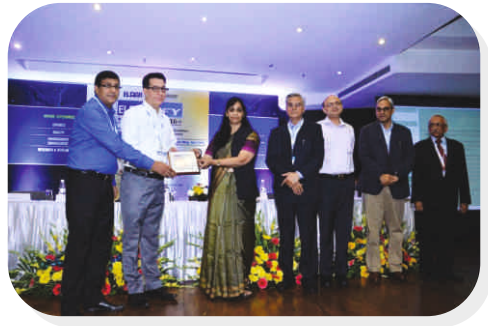
ELCINA-EFY Certificate of Merit for Outstanding Achievement in "Exports/Large Scale" Year 2016-17