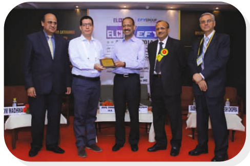
ELCINA-EFY Certificate of Merit for Outstanding Achievement in "Exports/Large Scale" Year 2013-14

Instituted in 1976 by Electronic Industries Association Of India, ELCINA awards are highly regarded in industry circles. Awards have been supported by officials of Department of Electronics & IT (Government of India) through their participation in selection process.