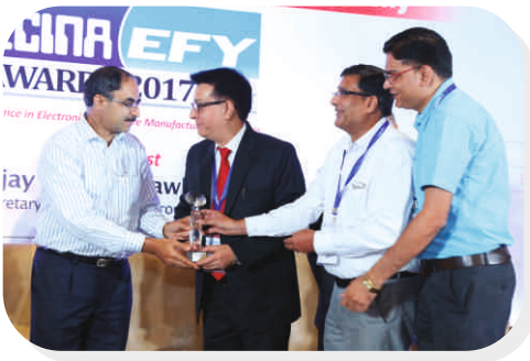
43 rd ELCINA-EFY Award for Outstanding Achievement in "Exports/Large Scale" Year 2017-18